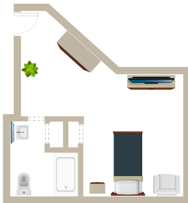
Private Studio #2